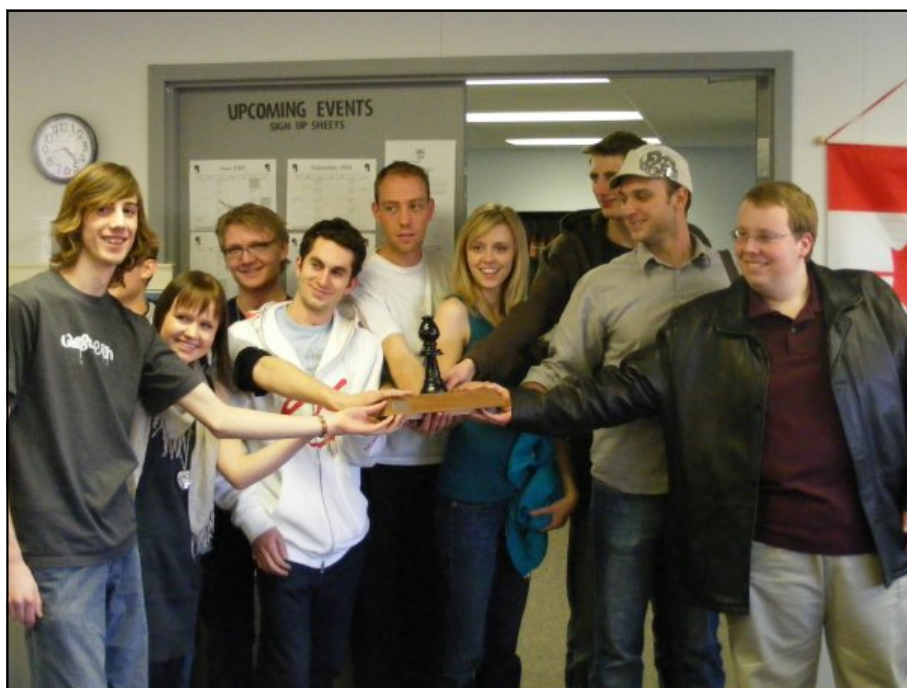
The winning team from the University of Calgary