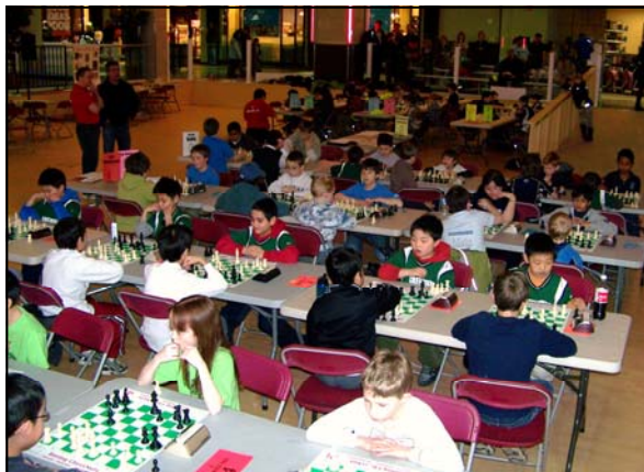
At West Edmonton Mall on January 23, 65 elementary school players battled in front of their parents and hundreds of

Westbrook Elementary School is back on top in scholastic team chess for Edmonton and region by having its teams win both the A and B sections of the West Edmonton Mall Team Match on Sunday, January 23.